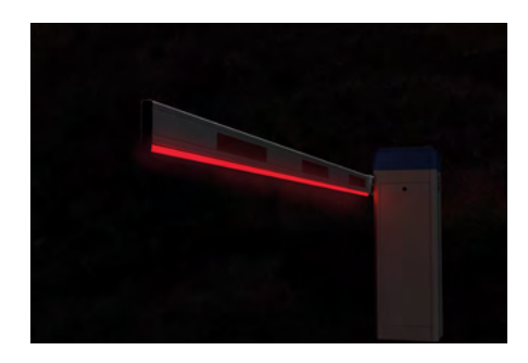
BOOM ARM WITH LED LIGHTING