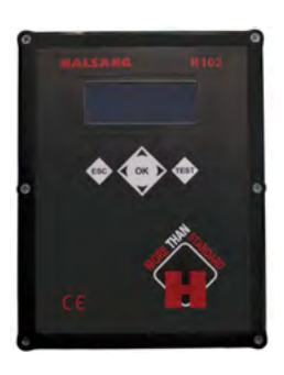
Electrical cabinet equipped with a Halsang H102 controller and frequency modulators